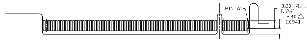
SECONDARY (SOLDER) SIDE